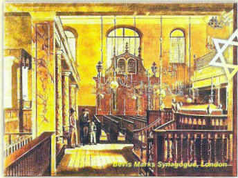
An 18th Century engraving showing the interior of the Spanish and Portuguese Bevis Marks Synagogue built in 1701.